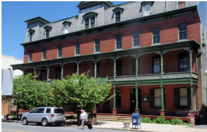
Union Hotel building within the Redevelopment Area

This area, also referred to as the "Union Hotel" is an Area In Need of Redevelopment that was declared by Borough Council in 2013 and expanded to include additional properties in 2017. It is composed of Block 22, Lots 4, 5, 6, 7, 8, 9, 10, 12, 13 and 14; Block 23, Lots 1 and 7; and Block 24, Lots 1, 2, 3, and 5. It is composed of 3.88 acres located along Main Street with additional frontage along Bloomfield Avenue, Spring Street, and Chorister Place.