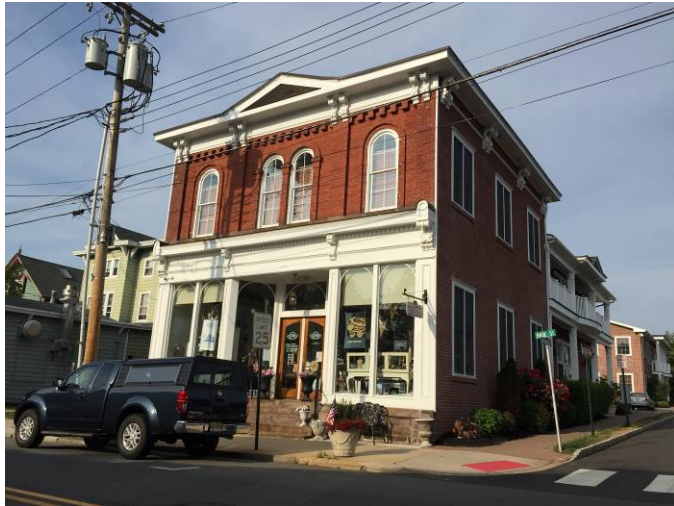
Flemington Electric building at the corner of Main Street and William Street

The project involved improvement of an existing developed lot. The developer retained five (5) existing apartments, approximately 800 square feet of commercial space and constructed six (6) additional apartments, one (1) of which is a moderate income rental unit. The certificate of occupancy of the existing building was issued on July 5, 2007 and the certificate of occupancy for the new building, which includes the affordable unit, was issued on June 21, 2007.