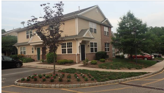
Martin Village along Allen Street

The project was certified by COAH during the August 6, 2003 second round substantive certification. The Flemington Borough Land Use Board granted amended final site plan approval on July 26, 2005. Subsequent to this amended final approval, the developer began construction in September 2005 and the project has since been completed. 1 The units were placed on the open sale market on October