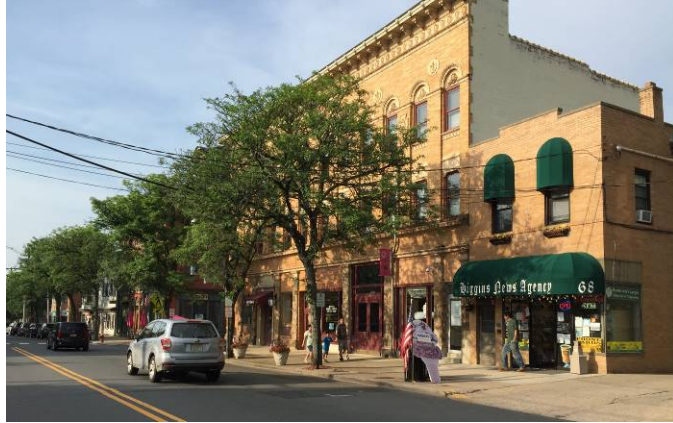
Downtown Flemington along Main Street

Flemington Borough is located in south-central Hunterdon County and is surrounded on all sides by the Township of Raritan. Flemington Borough has the distinction of being the county seat and a traditional center of population. The Borough is small in area, covering 1.07 square miles. Flemington is about 32 miles due west of the closet portion of New York City and 27 miles north of Philadelphia. The Borough is traversed by three (3) major transportation routes, State Route 31, State Route 12 and U.S. Route 202 and has access to major rail routes.