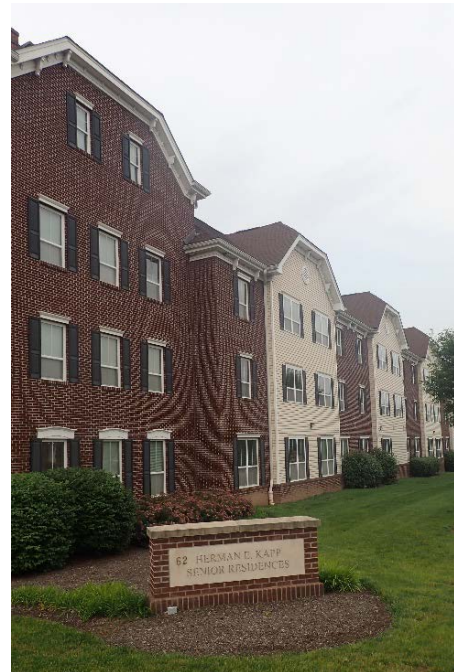
Herman E. Kapp Apartments along Church Street

The Hunterdon County Housing Corporation owns the land, which it leases on a long term basis (99 years) to Pennrose. This site was previously home to the County public work garage, which was demolished to make way for the rental complex. The Church Street complex is comprised of 51 one-bedroom and nine (9) two-bedroom apartments; three (3) of the units are fully handicapped accessible.